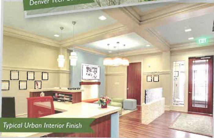
Typical Urban Interior Finish