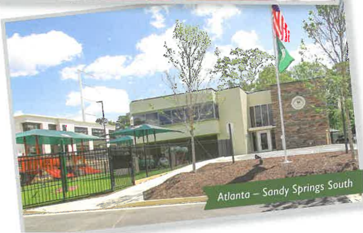
Atlanta-Sandy Springs South