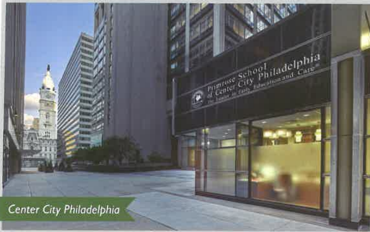
Center City Philadelphia