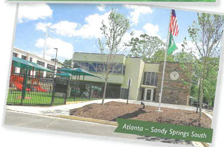
Atlanta - Sandy Springs South