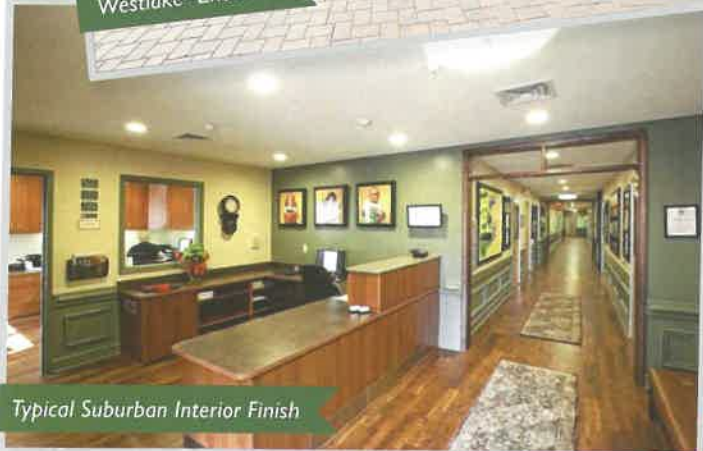
Typical Suburban Interior Finish