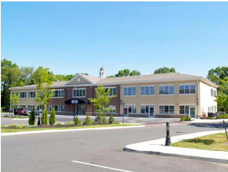
PHASE II – 21,600 SF