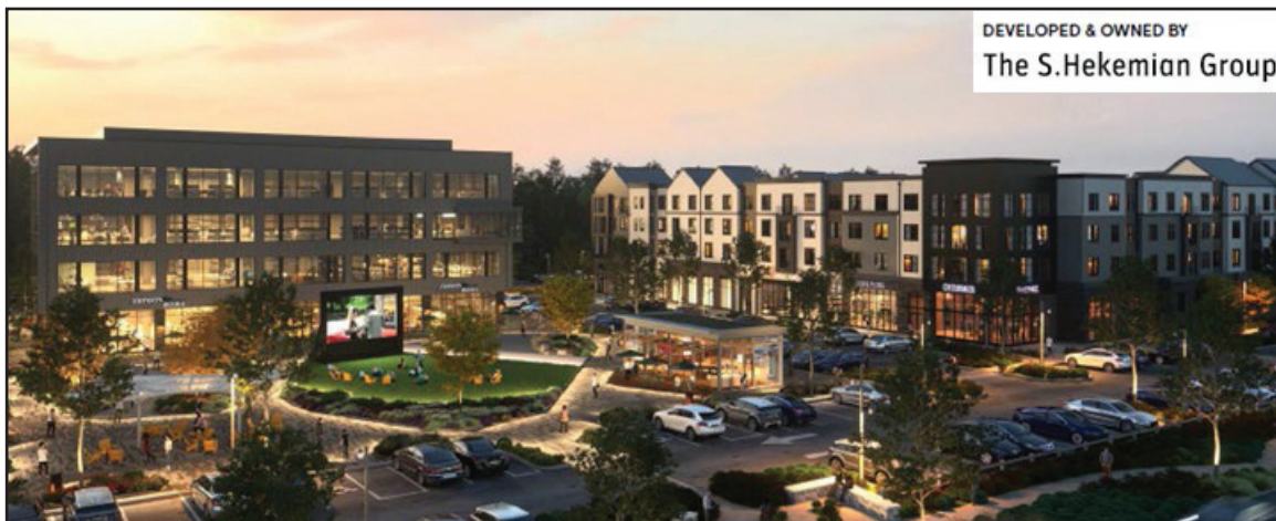
DEVELOPED & OWNED BY The S.Hekemian Group

B ERGEN COUNTY, NJ — As exclusive retail marketing and leasing agent, Silbert Realty & Management (SRM) is extremely pleased to announce that North Market is under construction with delivery projected December 2020. This 33-acre mixed-use development is another exciting project by owner / developer The S. Hekemian Group situated on the former headquarters of Mercedes-Benz USA. North Market is adjacent The Farm, a 231,000 SF lifestyle center leased